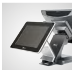
Customer displays in various designs (optional)