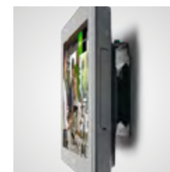
For table and wall mount (VESA)

Learn more from your Orderman partner or write to sales@orderman.com .