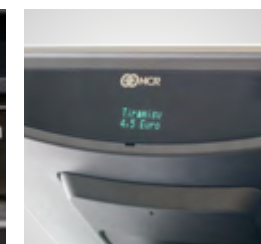
Elegantly integrated 2x20 character customer display (optional)