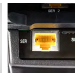
Direct connection of Orderman radio without power supply unit (PoE) (optional)